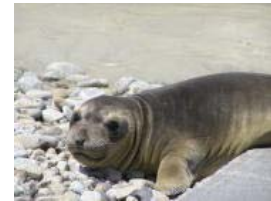
Sea lion pup